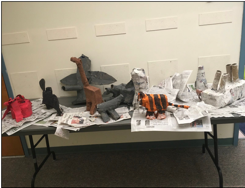
Kindergarten starts to build their paper mache' animals to go with their animal research reports.

The third trimester is off to a great start with students all around the building working on research writing. They have been gathering facts from a variety of sources and presenting their findings in creative and informative formats.